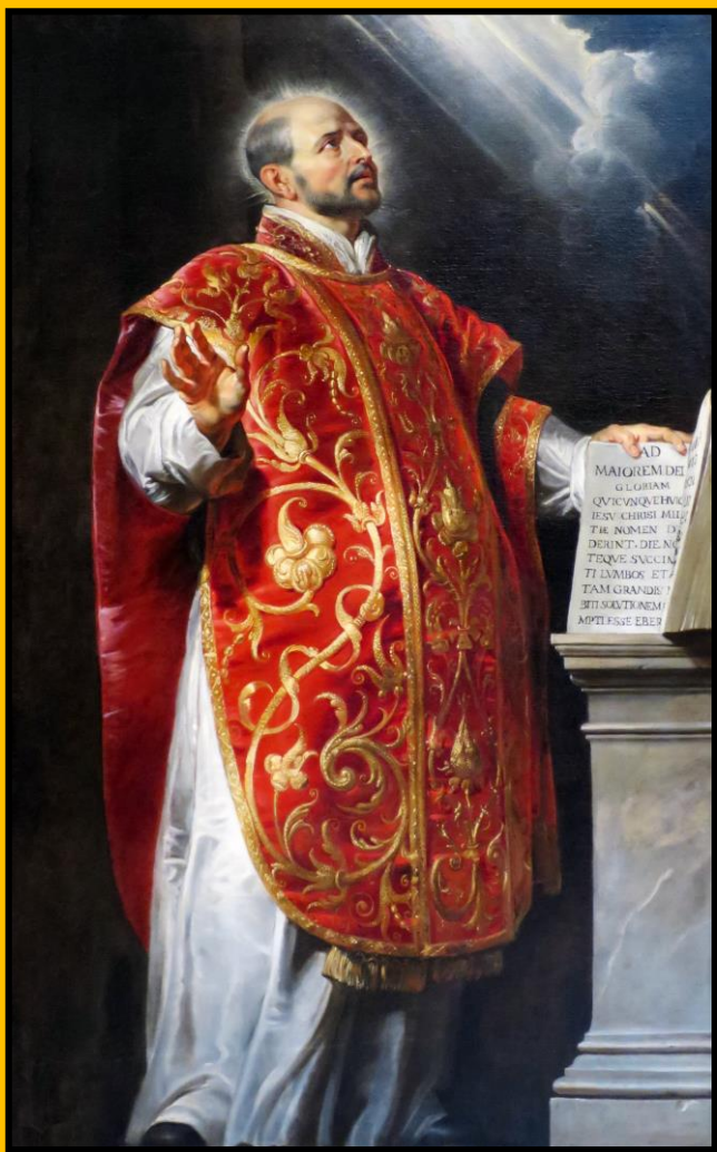
St. Ignatius of Loyola 1491-1556