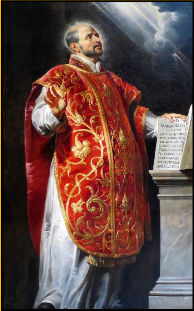
St. Ignatius of Loyola 1491-1556